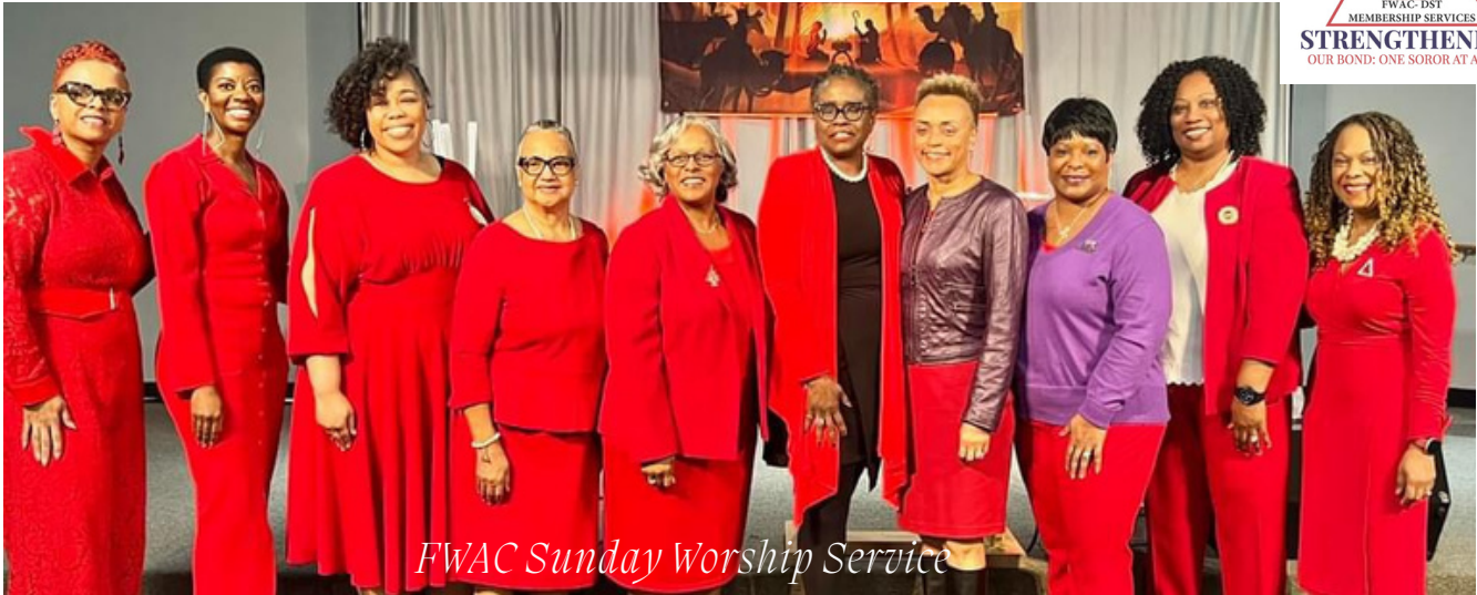
FWAC Sunday Worship Service